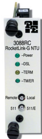
2U-high rack card version available